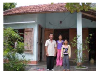
Example of rebuilt houses

Since April 2008, the establishment date of our association, we have helped financially 22 families to renovate/rebuild their houses. They can enjoy dryness since the late rainfalls of the year 2008 thanks to the new roof and walls of their new houses